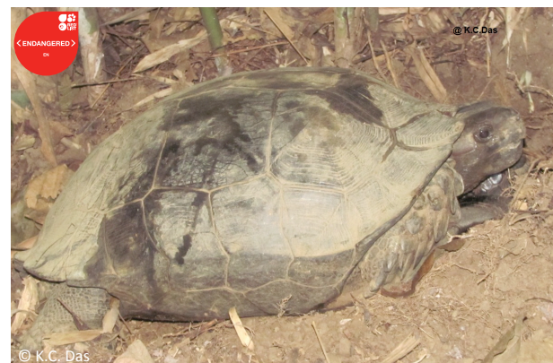
Image 2. Manouria emys phayrei , Lailapur hill forest, Cachar District of Assam

according to IUCN Red List (ATTWG 2000). M. emys is the largest tortoise in Indo-malaya and the fourth largest in the world. It is the largest land tortoise of Asia. This species is also commonly called the Brown-hill Tortoise, Asian Giant Tortoise, Asian Tortoise, Black Giant Tortoise, Burmese Brown Tortoise, Burmese Mountain Tortoise, Six-legged Tortoise and Eastern Hill Tortoise. The