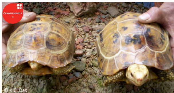
Image 1. Indotestudo elongata , Lailapur hill forest, Cachar District of Assam

Abbreviations: L = live specimens; C = Carapace; (#L or #C) = (# signifies number of live specimens or carapaces record) along with date of documentation; GPS Location available for sites. * Dialect of Bengali spoken in Barak Valley and the neighboring Sylhet District of Bangladesh.