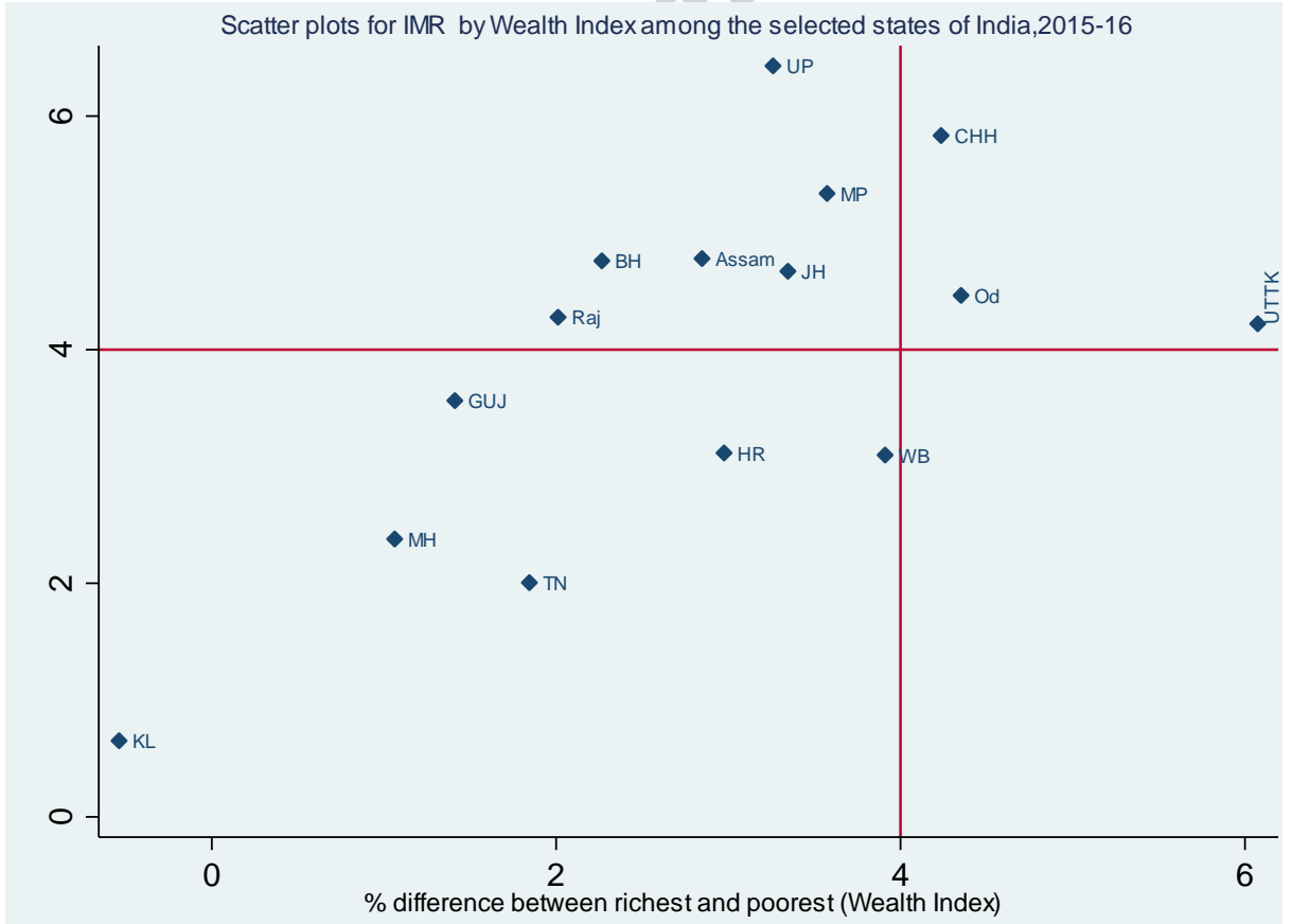
Figure1c: Scatter Plot of IMR and Wealth Inequality in Selected States of India, 2015-16.