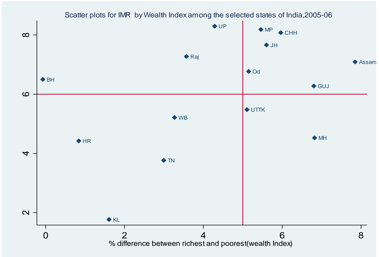
Figure1b: Scatter Plot of IMR and Wealth Inequality in Selected States of India, 2005-06.